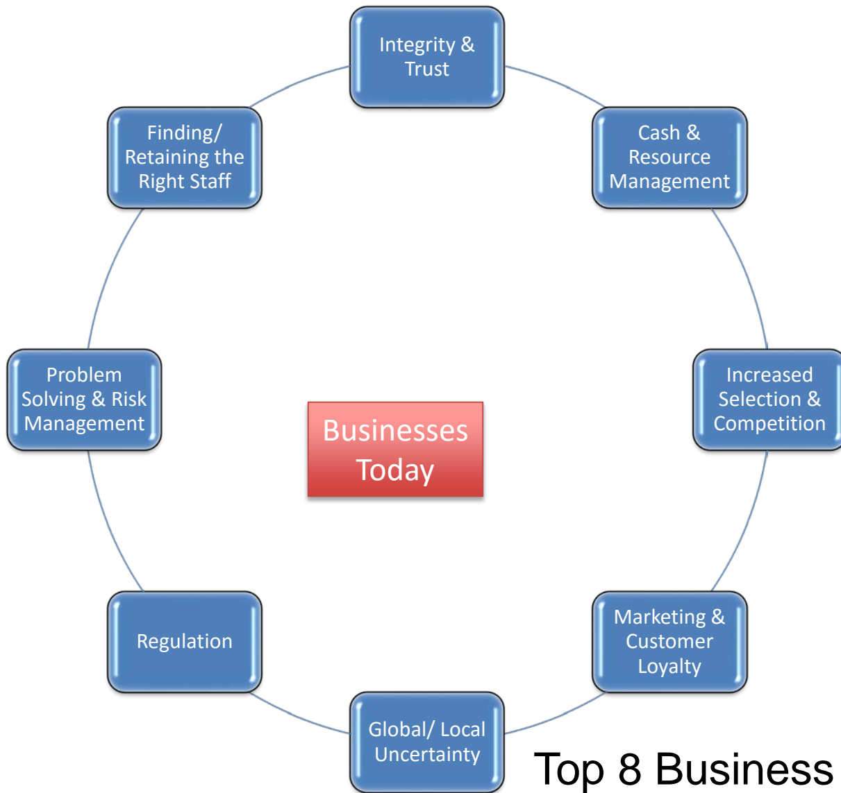
Top 8 Business Challenges